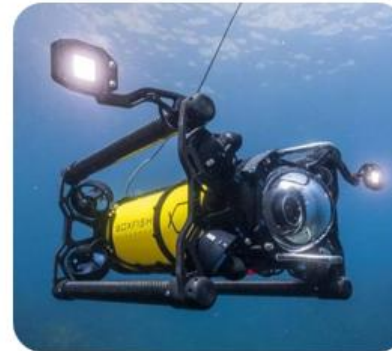
Remotely Operated Underwater Vehicles