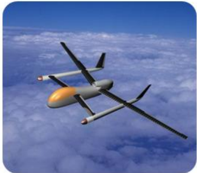
Unmanned Aerial Vehicles